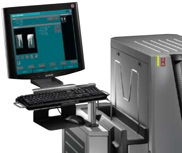
Integrated CR User Station for time-saving identification and optimized workflow.