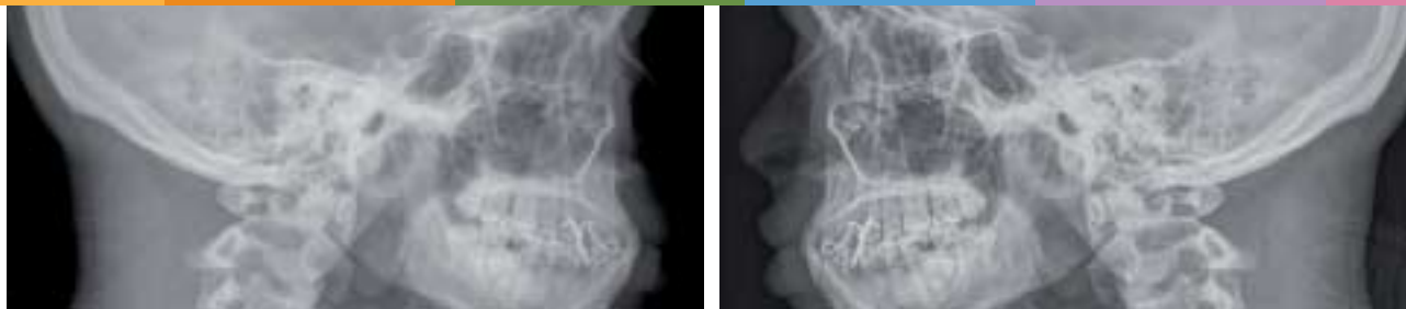
MUSICA 2 Image Processing

MUSICA 2 provides consistently reliable results by automatically analyzing image characteristics and optimizing processing parameters. The need for re- or post-processing is minimized. The resulting time savings let the technologist focus more on the patients.