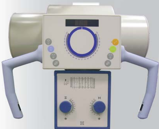
OTC10-M with optional x-ray tube and manual collimator