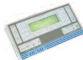
HF-30 Console with optional AP

Ideal for the budget minded practice, the HF-30 uses 20 kHz high frequency technology and provides full 30 kW power for general radiographic needs. The operator friendly console provides fast 2-point technique selection. An optional anatomical programming mode offers consistent, effortless images by fast, automatic technique selection.