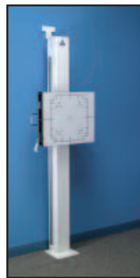
Conventional Vertical Structures for 17" x 17" or 14" x 36" film cabinets.