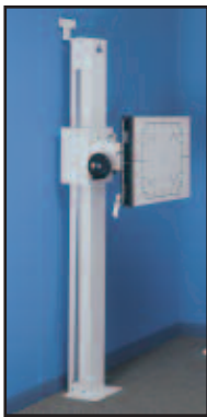
Tilting Bucky Structure with gear-driven adjustment, ideal for upper cervical images.

Over 1,200 DC-1 systems currently satisfy the radiographic needs of the chiropractic profession. Leading the industry, the DC-1 system includes a 0.6/1.5 mm fractional focal spot x-ray tube as standard to provide finer image detail and meet the unique application requirements of rare earth film and screens. In addition, the hospital grade 200,000 heat unit capacity of the tube compliments the increased power output of HCMI high-frequency generators. Also standard on the DC-1 is a full-length, Vertical Frame designed exclusively for chiropractic imaging to allow the heavy-duty 17" film cabinet to travel without contacting the patient. Complete spinal imaging is easily performed without re-positioning the patient. A 10:1 ratio, fine line grid and heavy-duty cassette tray are included as standard for the optimal in image quality. Examples of popular options to the DC-1 include: