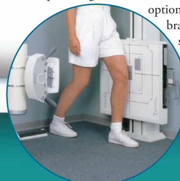
Weight bearing Studies with central x-ray beam only 13.75" above floor

Contemporary yet highly functional, the Quantum VERTI-Q Vertical Wall Stand was designed with the technologist in mind. A single-columned structure, the VERTI-Q is durable, easy to use and incorporates careful attention to detail and design. Operator safety and control is reinforced through integral counterbalancing and a FAIL-SAFE* electromagnetic vertical braking system. Extensive vertical travel enables great flexibility for skull through weight-bearing examinations. The VERTI-Q features Quantum's exclusive EZ-Glide hand control for simple, effortless adjustment of the image receptor. Available for use with either 14" x 17" or 14" x 36" maximum cassette sizes, the VERTI-Q can be matched with multi-speed reciprocating buckies or fixed grid cabinets. An optional 8-inch extension bracket simplifies seated examinations.