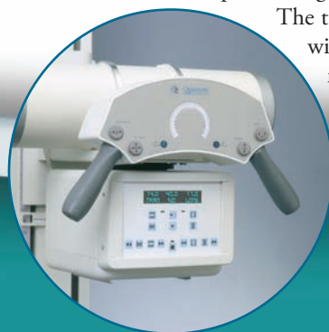
QS-510 Hand grip with Optional "Selectable" Collimator (R40-S)

The tube head assembly provides various angulations with detent positions for complete coverage of all radiology exams.